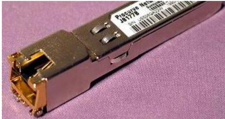
Figure 1. Latch in locked position